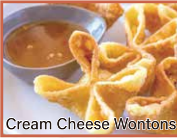
Cream Cheese Wontons