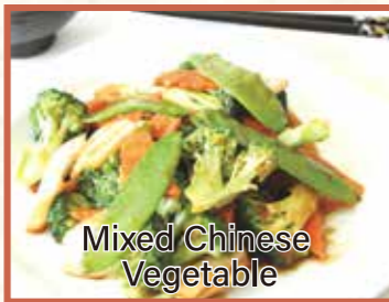
Mixed Chinese Vegetable