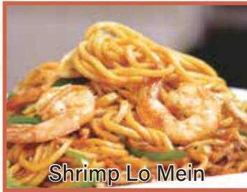
Shrimp Lo Mein