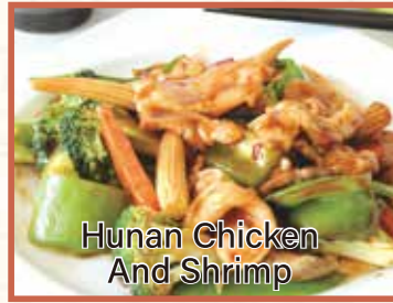
Hunan Chicken And Shrimp