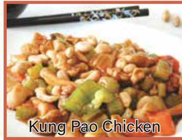
Kung Pao Chicken