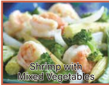
Shrimp with Mixed Vegetables